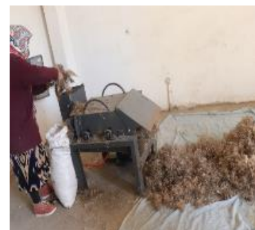
Photos 7,8,9 illustrate wool processing work in the workshop "Muynak baraka Impex" in "Ali auyl" of Muynak district

Output 1.2. Enabling environment for youth entrepreneurship development created through establishing new businesses and start-up initiatives using innovative and impact-based technologies and solutions. (UNDP).