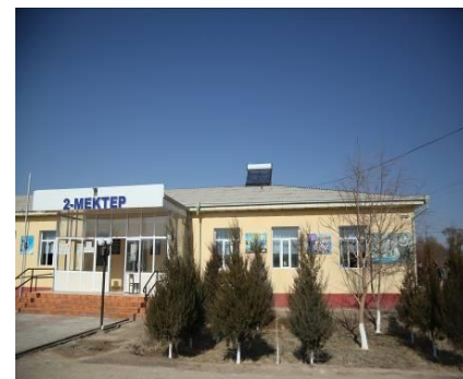
Photos 28, 29,30: School # 2 in Bozatau is connected to clean drinking water supply network and hot water supplied by Solar Water Heater