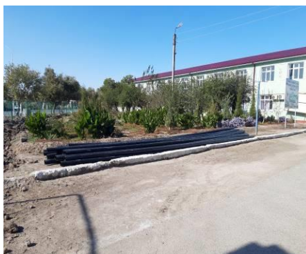
Photos 28, 29: Drinking water pipeline laying in Kungrad District Hospital