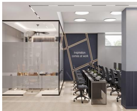
Photos 10, 11: Preliminary designed images of Start-up platform in Nukus