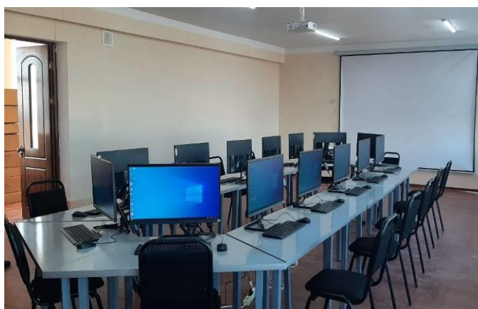
Photos 26, 27: Pupils of three schools in Bozatau, Kungrad and Muynak have better access to internet and digitalization