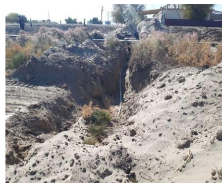
Photo 30:Drnking water pipeline laying in Polilinic #22 in Suenli VCC, Kungrad