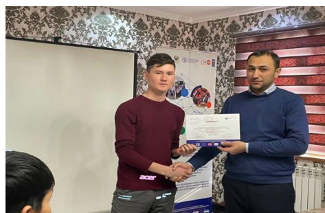
Photo 16, 17, 18: Beneficiaries of pilot districts are obtaining knowledge and skills in efficient agriculture practices