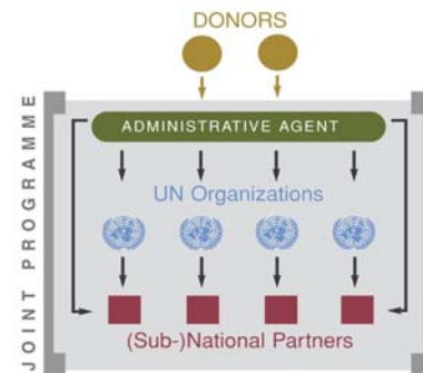
Graphic illustration of fund management for a Joint Programme with Pass-Through Funding

It has been agreed that each participating UN organization will take appropriate measures to publicize the joint programme and to give due credit to the other participating UN organizations. Information given to the press, to the beneficiaries of the joint programme, all related publicity material, official notices, reports and publications, shall acknowledge the role of the host government, the donors, the participating UN organizations, the Administrative Agent and any other relevant parties. In particular, the Administrative Agent will include and ensure due recognition of the role of each participating UN organization and national partner in all external communications relating to the joint programme.