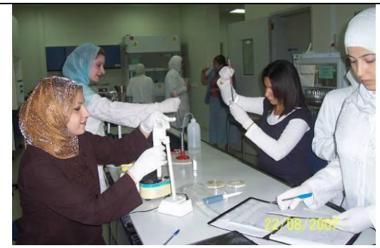
Lab. Technicians participated in TOTs outside Iraq