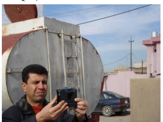
Sanitary technicians testing drinking water