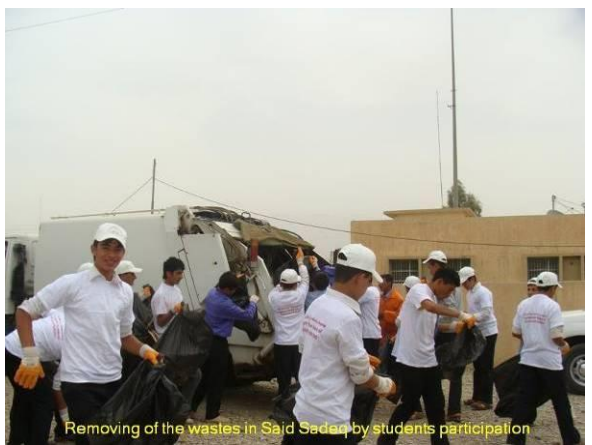
School children cleaning the environment in Suliemaniya City

Delays in programme implementation, nature of the constraints, actions taken to mitigate future delays and lessons learned in the process.