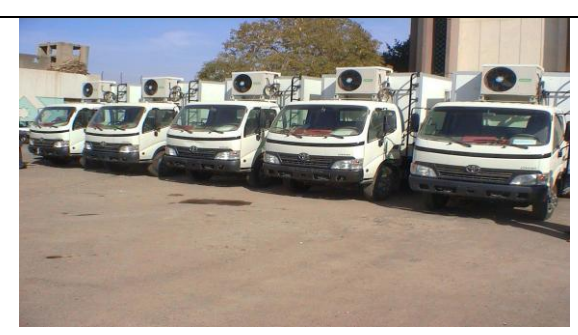
The mobile laboratories delivered to End-users