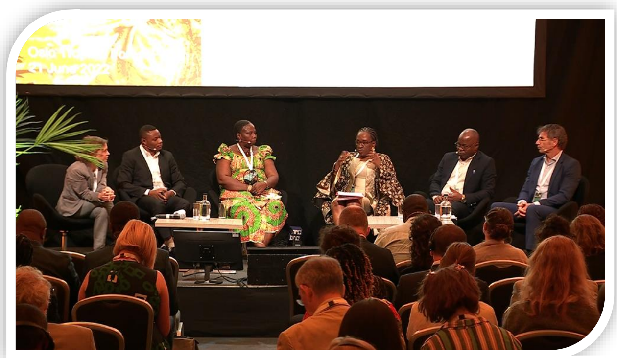
Well-attended CAFI event at the Oslo Tropical Forest Forum

Watch CAFI's full event at the Oslo Tropical Forest Forum: Win-win opportunities for people and forests in Central Africa (vimeo.com)