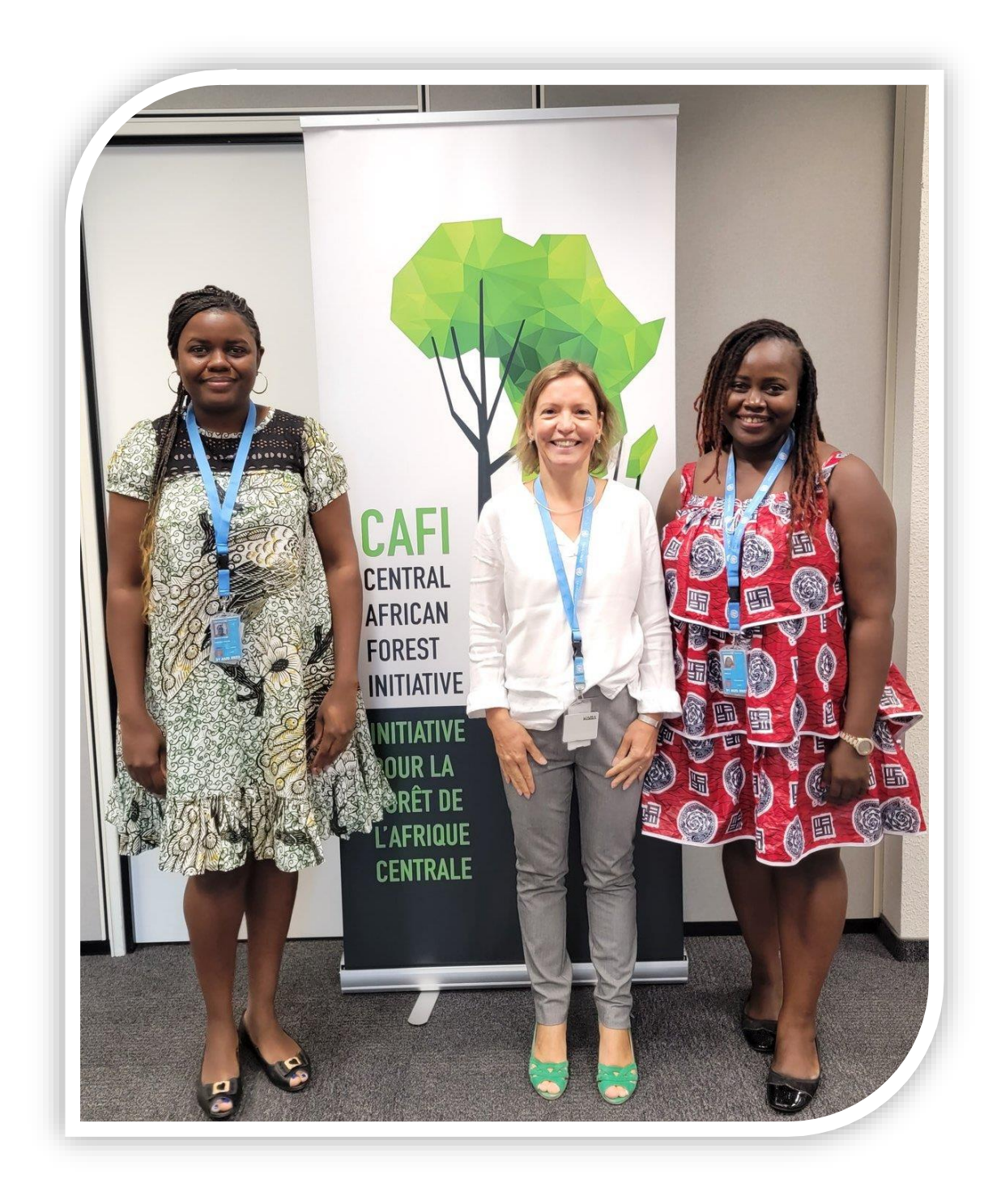
CAFI Director with the first two fellows under the CAFI Fellowship programme

Building expertise among young central African professionals in human development and climate change mitigation is essential for long-term forest protection in the region. That's why CAFI launched a fellowship program at its Secretariat in Geneva, to invite young talents from the region to join its team for one year and grow skillsets that can in turn benefit future actions for Central African forests and people. The first two fellows, two women from Cameroon, joined the CAFI Secretariat team in 2022.